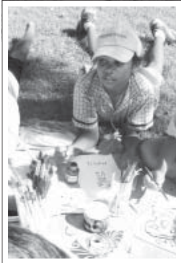
△ A group drawing with black ink using bamboo pens, inspired by artist Francine Hollingsworth